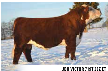
JDH VICTOR 719T 33Z ET