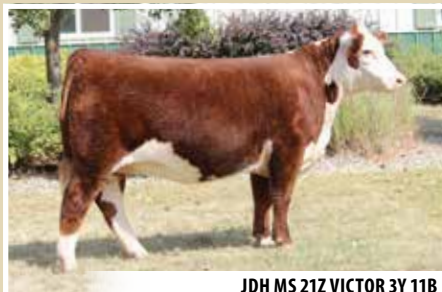
JDH MS 21Z VICTOR 3Y 11B