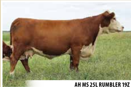
AH MS 25L RUMBLER 19Z