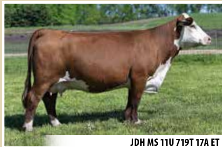
JDH MS 11U 719T 17A ET

Size: H DEBERARD 7454 ET X Dam: JDH MS 11U 719T 17A ET •• Three grade 1 IVF embryos.