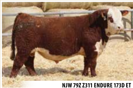
NJW 79Z Z311 ENDURE 173D ET

Size: UPS MIGHTY 7850 ET X Dam: ROUDY INDIGO 210 •• Three grade 1 IVF embryos.