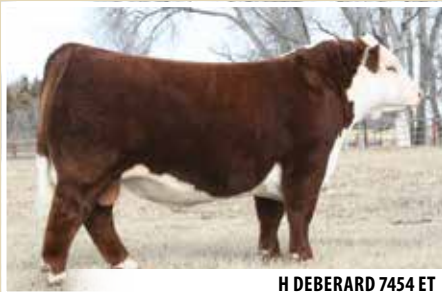
H DEBERARD 7454 ET

Size: H DEBERARD 7454 ET X Dam: AH MS 25L RUMBLER 19Z •• Three grade 1 IVF embryos.