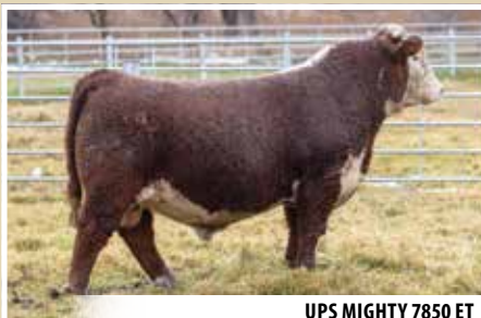
UPS MIGHTY 7850 ET