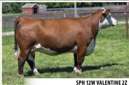
SPH 12W VALENTINE 2Z